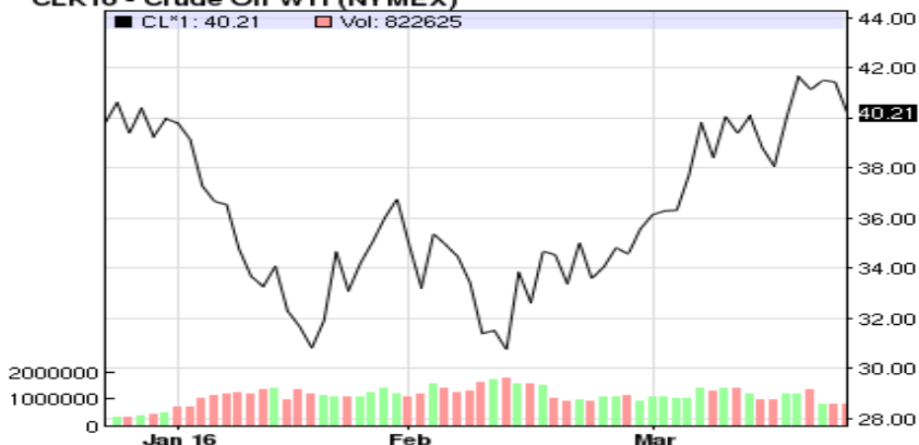
CLK16 - Crude Oil WTI (NYMEX)

Global oil prices trend: