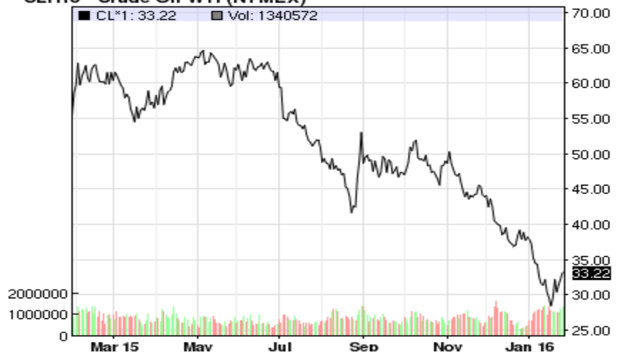
CLH16 - Crude Oil WTI (NYMEX)