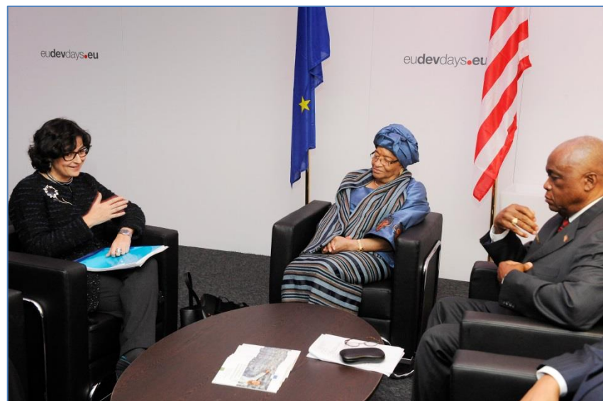
President Ellen Johnson Sirleaf (centre) and ITC Executive Director Arancha González (left) discuss the Liberia National Export Strategy on 26 November 2013 in Brussels.