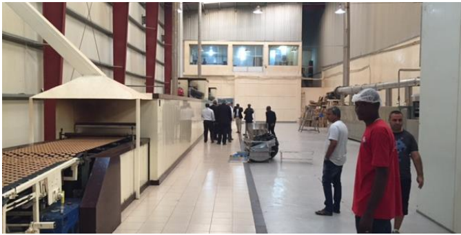
Inside the Biscuit Manufacturer TIBA Group Industries