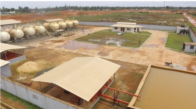
LPG-Packaging Facility by NP Liberia inside the MIP

In July 2016, the Management of the MIP has been officially turned over by the Office of the President from NIC to the MoCI by an official letter for purposes of accelerating the development. The MoCI has since been fast-tracking the development of the MIP under the leadership of the Deputy Minister for Industry (DMI).