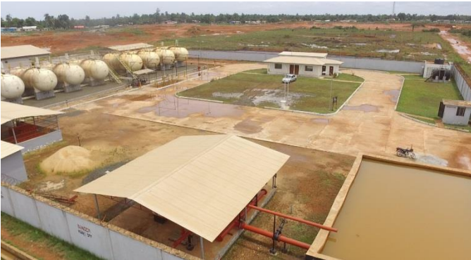
LPG-Packaging Facility by NP Liberia inside the MIP

In July 2016, the Management of the MIP has been officially turned over by the Office of the President from NIC to the MoCI by an official letter for purposes of accelerating the development. The MoCI has since been fast-tracking the development of the MIP under the leadership of the Deputy Minister for Industry (DMI).