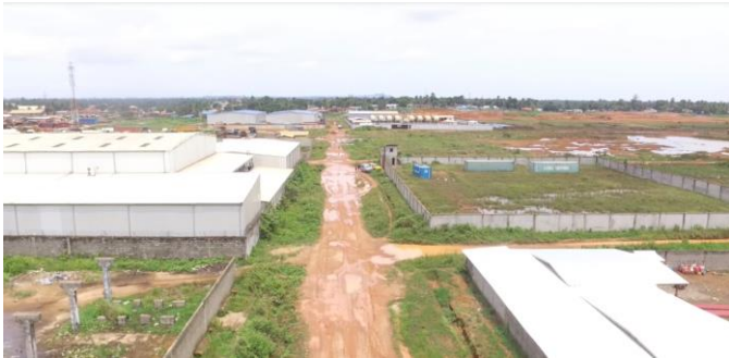
Aerial view of the Monrovia Industrial Park (TIBA on the left)