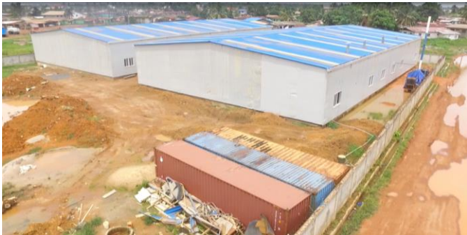
Site by West African Venture Funds