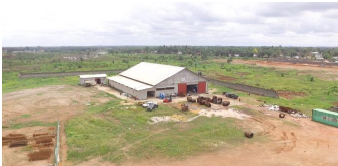
Garson Steel manufactures wire nails inside the MIP