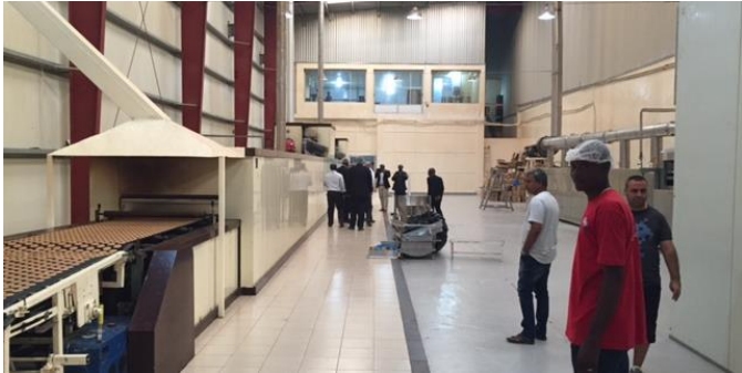
Inside the Biscuit Manufacturer TIBA Group Industries