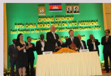
Signing ceremony of the extension of the Memorandum of Understanding (MoU) - 20 March 2017