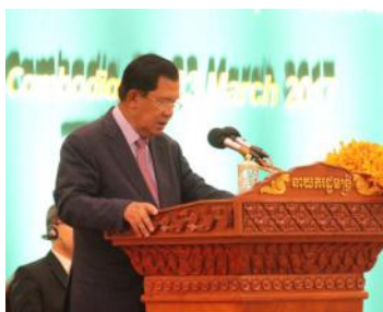
H.E. Mr Hun Sen, Prime Minister of Cambodia