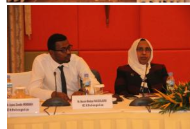
Participants from Ethiopia and Somalia