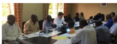
Accession of Comoros — Working Party Chairperson's visit in Moroni — 8-10 March 2017