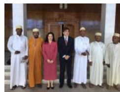
Meeting with Members of Parliament