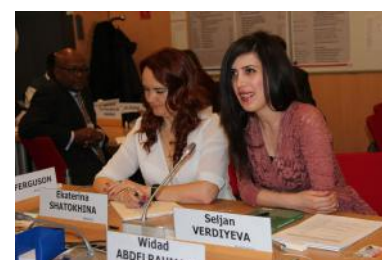
Training course on Goods for WTO Accessions — Participants from Belarus and Azerbaijan — Geneva, 27-31 March 2017

trading enterprises and three pieces of legislation. On the basis of these inputs, the Secretariat will revise the draft Working Party Report. Azerbaijan is also expected to submit a revised Legislative Action Plan, updated agriculture supporting tables; and the replies to questions raised on the agriculture supporting tables. The next meeting of the Working Party is tentatively scheduled for June.