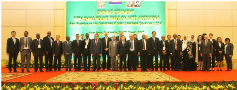
Opening Ceremony — Group photograph — 20 March 2017

The Fifth China Round on WTO Accessions Table took place on 20-23 March 2017 in Siem Reap, Cambodia under the thematic focus of "Best Practices on the Accessions of LDCs".