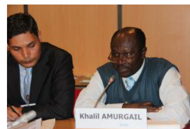
Training course on Goods for WTO Accessions — Participant from Sudan — Geneva, 27-31 March 2017