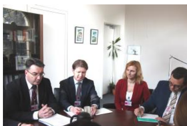
Accession of Belarus — Meeting with Amb. Serpikov Geneva, 27 March 2017

Belarus: A delegation of Belarus led by Ambassador Vladimir Serpikov, Chief Negotiator for the WTO accession, visited Geneva during the week of 27 March. The delegation held bilateral meetings with several Members, including on market access negotiations. They also met with the Secretariat to exchange views on developments in the accession process and technical issues. The delegation reported on the high-level political engagement from the Government and the mobilization of technical