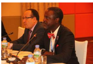
H.E. Mr Axel Addy, Minister of Commerce of Liberia and H.E. Mr Humayoon Rasaw, Minister of Commerce and Industries of Afghanistan

(Afghanistan, Cambodia, Lao PDR, Liberia, Nepal, Samoa, and Yemen); and six other WTO Members (Argentina, China, European Union, Japan, Kenya and Oman), including former and current Working Party Chairpersons. The representatives of the Enhanced Integrated Framework Executive Secretariat, the International Monetary Fund and the International Trade Centre also attended.