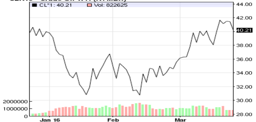
CLK16 - Crude Oil WTI (NYMEX)

Source: www.globalpetroleumprice.com Global Trend: 2016