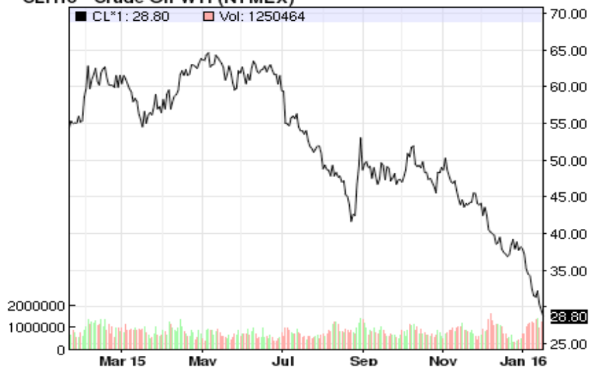
CLH16 - Crude Oil WTI (NYMEX)

Global oil prices trend: Jan. 2015- 2016