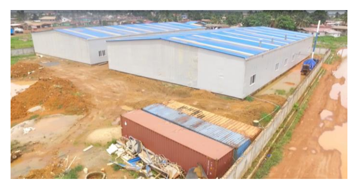
Site by West African Venture Funds