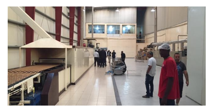
Inside the Biscuit Manufacturer TIBA Group Industries