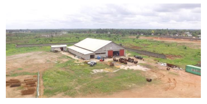
Garson Steel manufactures wire nails inside the MIP