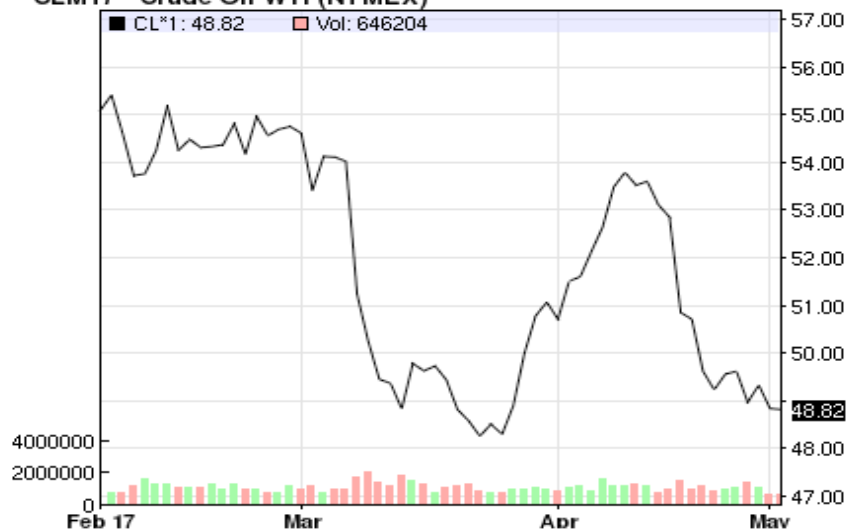
CLM17 - Crude Oil WTI (NYMEX)